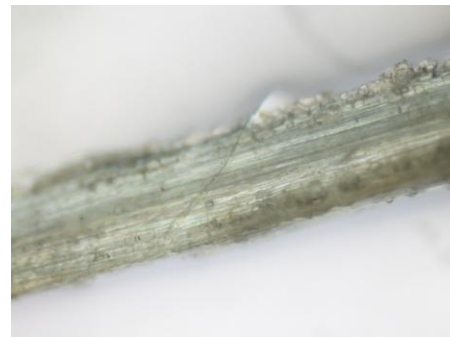
Figure 5 : The long section of the fiber