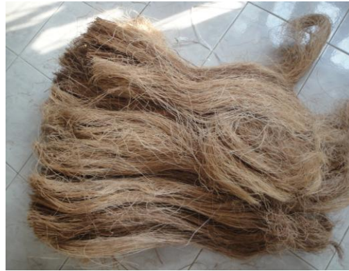
Figure 1 Appearance of the fibers from the shaft Nypa Palm.

3.1 The experiments to separate the fibers from the shaft Nypa Palm of District of Village Paknaam Samut Prakan province the fiber through separation of fiber by means of beat and fibers of the fiber with a comb nails it. The fiber has a length of about 70 - 90 cm. the surface is not smoot and a rough and the fiber is very stiff. Because the fibers are combed with a comb nail carding.