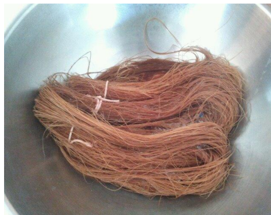
Figure 2 The fibers from shaft Nypa Palm scouring process.

3.2 Experimental scouring process fibers from the shaft Nypa Palm of the fibers through a process of scouring , then the fibers are very soft. Not stiff and impurities such as dirt or mud on the surface of the fiber. Because of wetting agent, and Sunlight soap that enhances the softness to the fabric.