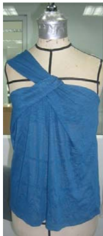
Figure 4: Sampling of the flat pattern making

After making the completed samplings - both of the flat pattern making and draping techniques as shown in Figure 5&6, the whole samplings were worn by 6 models who later gave responses to the questionnaires for surveying the satisfaction. The results were shown in Figure 7 – 8 and in Table 2 – 3.