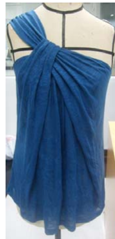
Figure 5: Sampling of the draping Technique