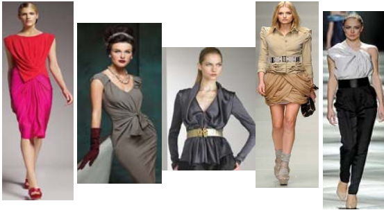
Figure 1 : Samples of Fashionable styles

This research is aimed to evaluate the efficiency of flat pattern making and draping techniques as well as to find the models' satisfaction while wearing the dresses that are being sewn by flat pattern making technique and draping technique.