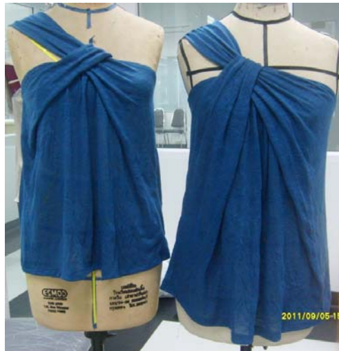
Figure 6: Comparison between the sampling made from the flat pattern making technique (left figure) and the draping technique (right figure)