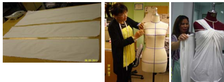
Figure 3 : Steps of Draping Making Technique of Sampling Design